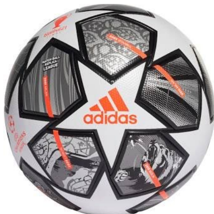
CCL Match ball: size 5 adidas Champions League Match Ball